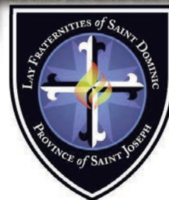
Hosted by: Holy Rosary Fraternity, Third Order Dominicans Summit, NJ